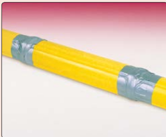
• Close-up shows two sections of the Model 6500 riveted and taped together with a standard length coupling.