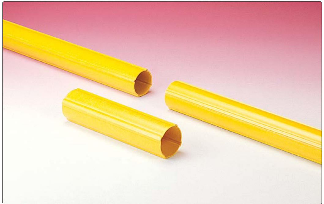
• Two sections of the Model 6500 Inclinometer Casing shown with a standard length coupling.