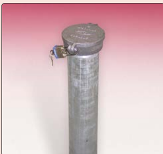
• Model 6501-6-2 Inclinometer Casing Protective Housing, 4" galvanized steel pipe with lockable cap.