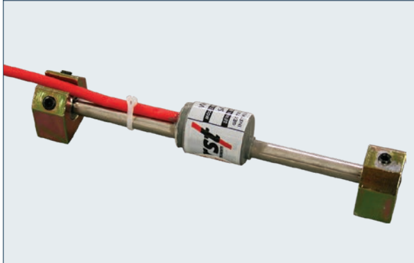
Vibrating Wire Arc Weldable Strain Gauge